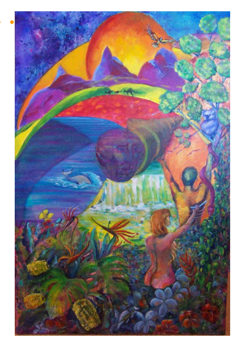
It is truly a colourful painting so get your cheque books or cash ready to bid or pay for this wonderful painting

The tunnel can illustrate a timetunnel, shell, mechanical creations of our modern times.