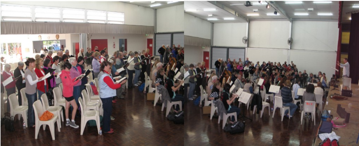
Noosa Chorale and Sunshine Coast Choral Society at final rehearsals with orchestra, last Sunday, for the St Matthews Passion Concert on Saturday 17th July, Lake Kawana Community Centre

6 Months Hard Labour (not of the Kevin type) and you all benefit. Bach's St Matthews Passion is here Saturday 17th July