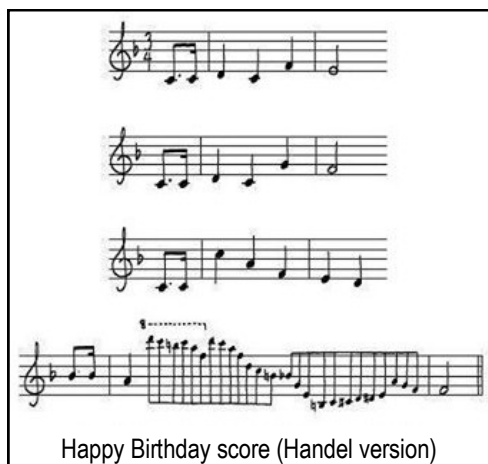
Happy Birthday score (Handel version)