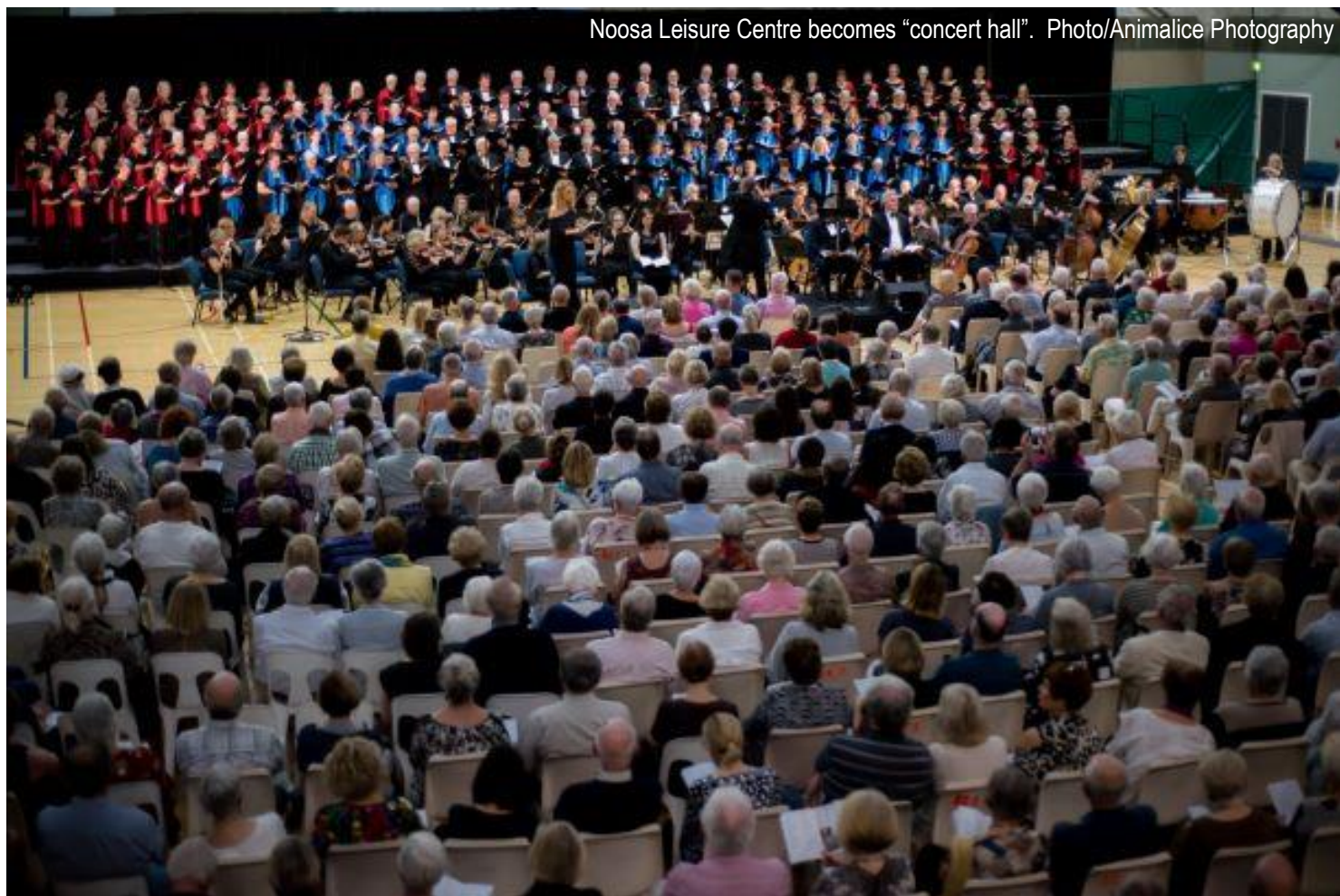
Noosa Leisure Centre becomes “concert hall”.

Standing ovation at Birtinya! See page 4