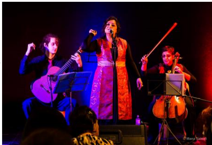
Sweet Sound Ensemble

It is entitled “Rebirth”, and toured in Australia, the United Kingdom and the United States. The work employs multiple art forms—music, song, dance, poetry. Narrated in English and Farsi, it explores the journey through hope, life, love, restriction, rebellion, and finally rebirth.