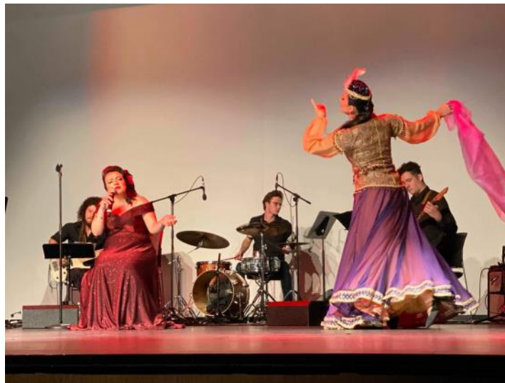
Kooch—Songs of Migration—Brisbane