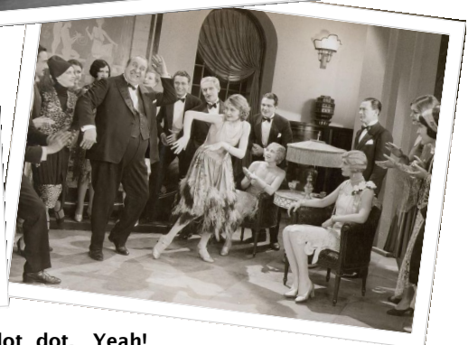
Dot dot da-dot dot. Yeah!