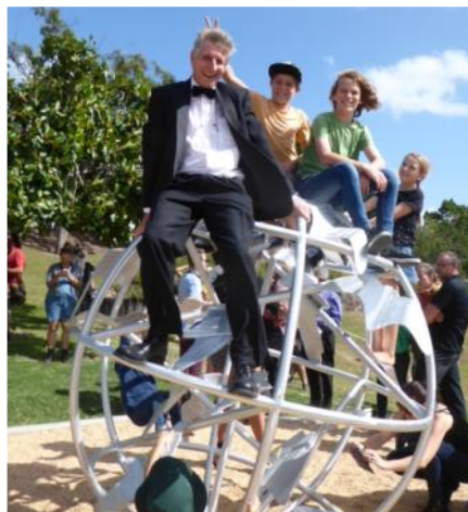
Assorted kids of different sizes gleefully jumped onto the Spirit Orb of Peace after its unveiling at the Eumundi amphitheatre.