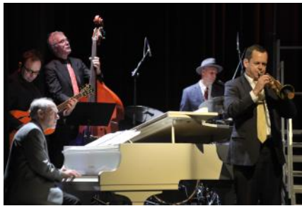
The Australian Jazz Ensemble