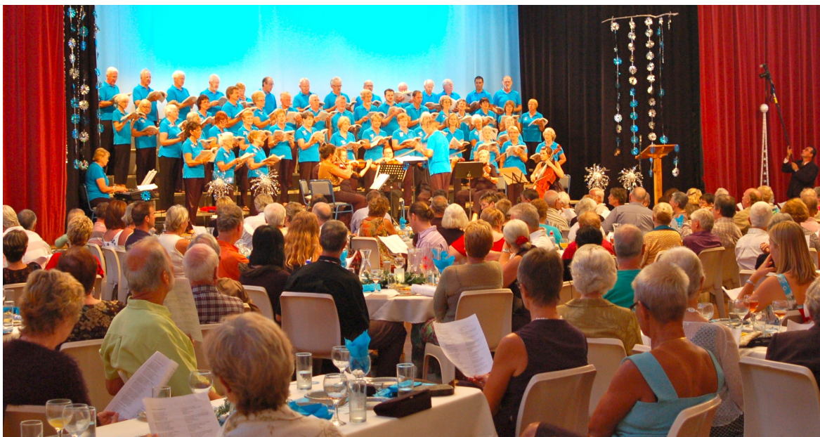
Audience members in 2008 get ready to start wassailing along with the choir.