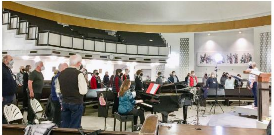
The Bytown Voices choir (formerly Glebe Singers) has found ways to sing in person while still following public health guidance. Its next concert will be in December.