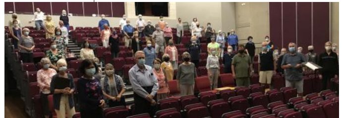
Noosa Chorale masked rehearsal in 2021

We were very fortunate in being able, apart from a few disruptions, to undertake a full year of rehearsals, and perform our three main concerts of 2021, just managing to squeeze everything into the gaps between Covid restrictions and lockdowns.