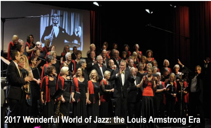
2017 Wonderful World of Jazz: the Louis Armstrong Era