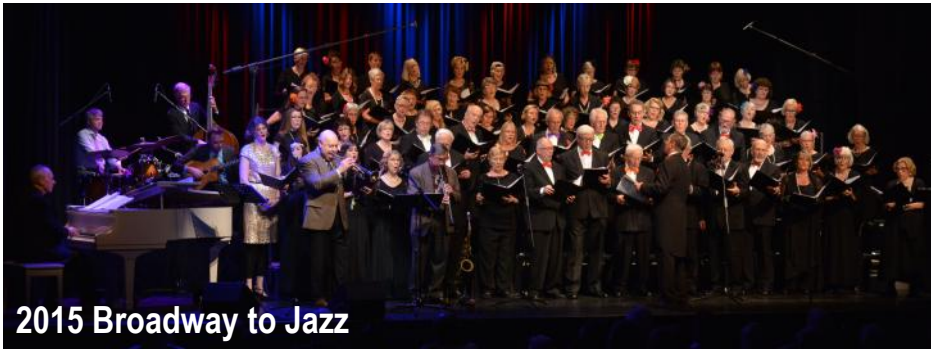
2015 Broadway to Jazz