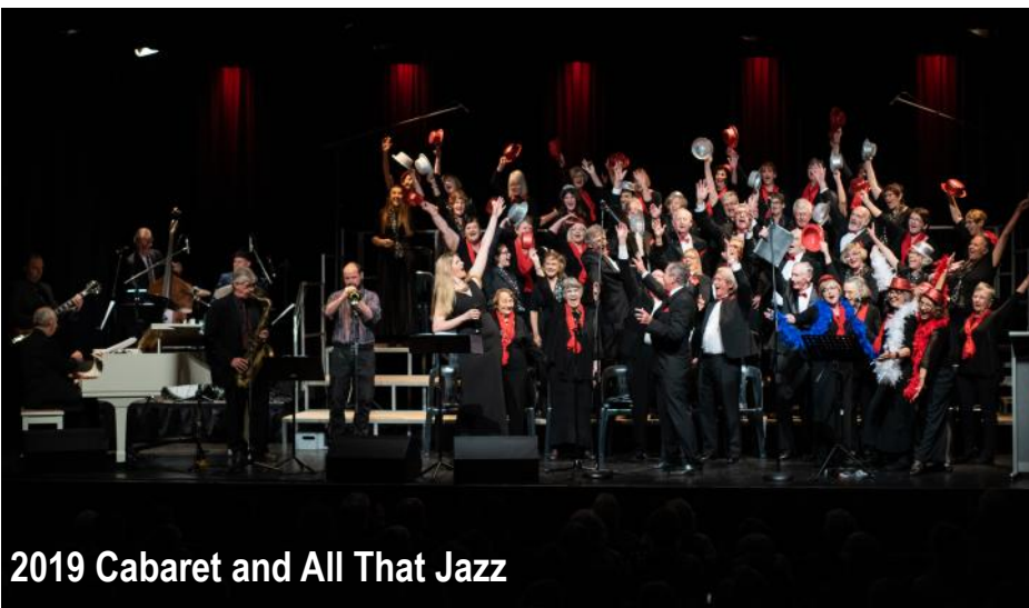
2019 Cabaret and All That Jazz