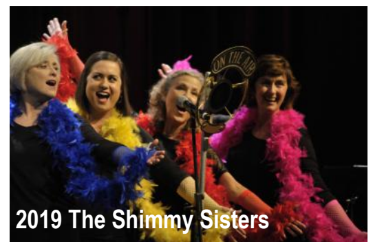
2019 The Shimmy Sisters