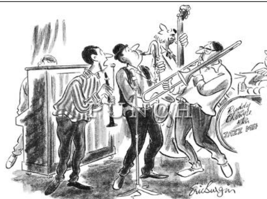
I've forgotten which tune we're improvising on.