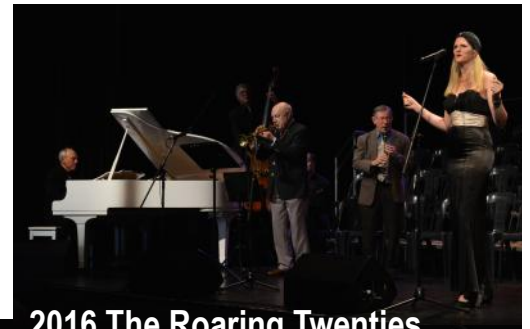
2016 The Roaring Twenties