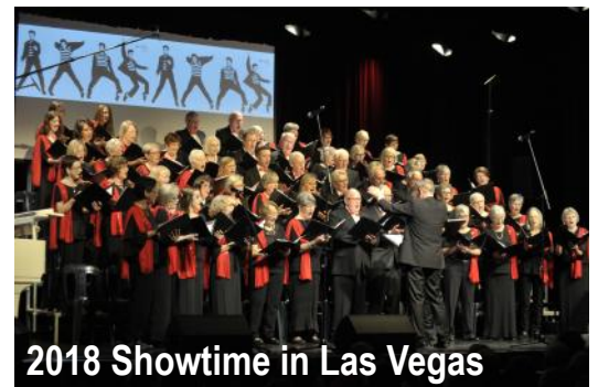
2018 Showtime in Las Vegas