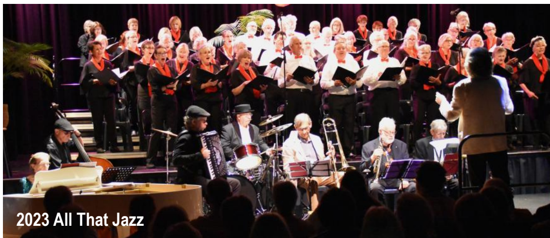
2023 All That Jazz